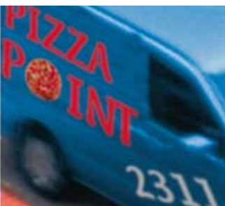
2 Vehicle graphics Pressure-sensitive vinyl for fleet graphics, vehicle wraps, and decals. Kiss-cut and contour-cut.