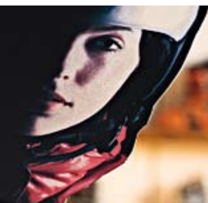
2 Hanging signs Contour-cut acrylic mobile, routed at unprecedented speeds thanks to optimized vacuum hold-down.