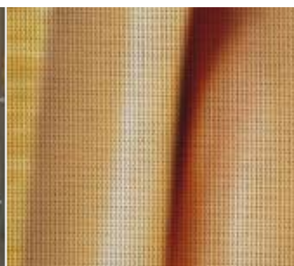
4 Transparent graphics Oversized mesh banners and building wraps cut at high speeds with motor-driven rotary tool.