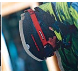
4 Displays Cut or routed lightweight POP/ POS materials up to 50 mm/2" thick. Ideal for in-store decorations.