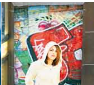
3 Light boxes Scrolling light boxes and backlit displays trim-cut perfectly at high speed.