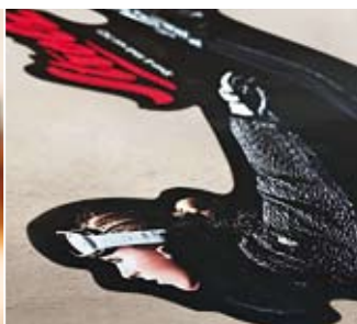
3 Floor graphics Laminated adhesive-backed vinyl, kiss-cut and through-cut, for floor decals and floor mats.