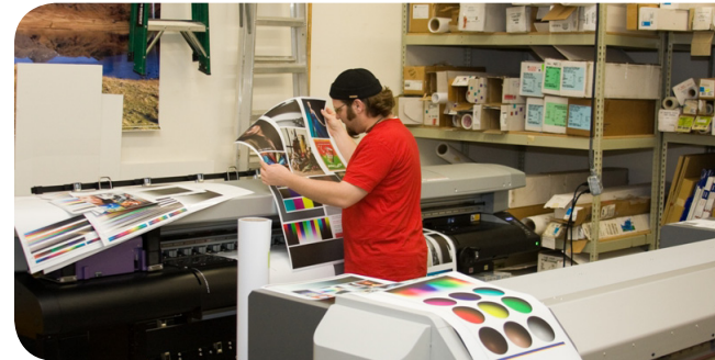
Print to 2 aqueous inkjet, entry-level solvent, large-format solvent, or lower-cost flatbed printers.