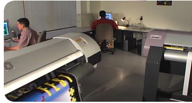
Drive up to 2 Printers with PosterShop for consistent color and workflow across devices.