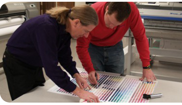
With the simple "Print, Read, Next" Profile Generator you can be in complete control of your color and material costs.