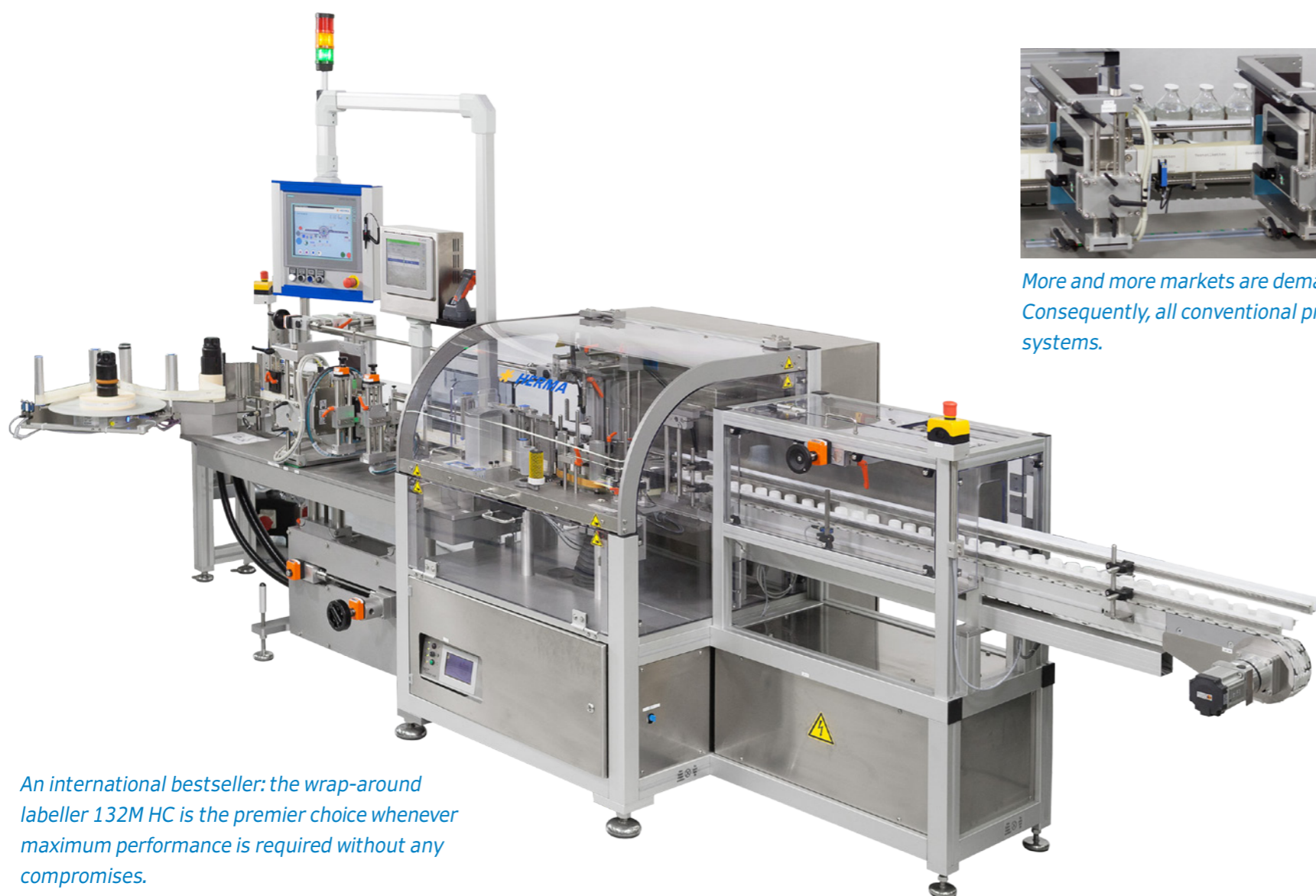
An international bestseller: the wrap-around labeller 132M HC is the premier choice whenever maximum performance is required without any compromises.

HERMA labelling systems are always qualified according to the customer's individual wishes and needs – from hardware and software specifications, FMEA, traceability matrices, IQ and OQ, to factory and site acceptance tests.