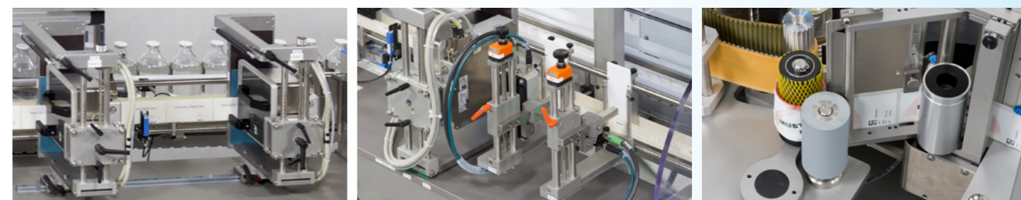
More and more markets are demanding sophisticated precautions to ensure the traceability of pharmaceutical packaging. Consequently, all conventional printing, monitoring and rejection systems can be easily integrated in HERMA labelling systems.