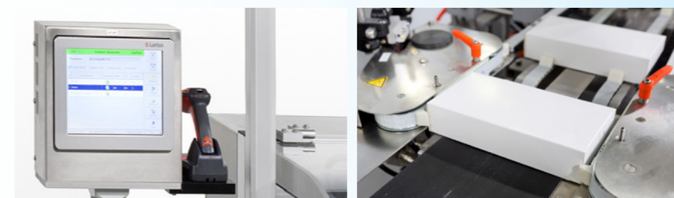
Today's systems from HERMA are already fully equipped for Track & Trace and serialisation tasks, such as those arising from EU directive 2011/62/EU and other regulations. We have likewise developed compelling solutions that meet tamper-evidence requirements.