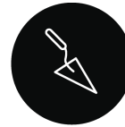
Damp Proof Course