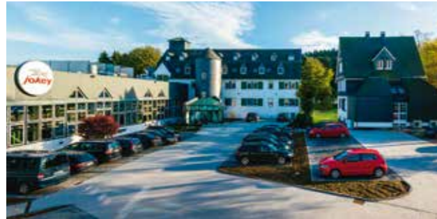
Headquarters of Jokey Plastik Wipperfürth GmbH Germany