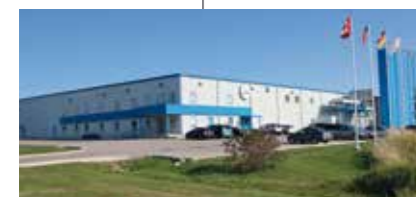
Jokey Plastics North America Inc. Canada