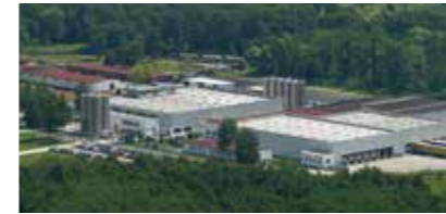
Jokey Plastik Blachownia Sp. z o.o. Poland