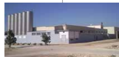
Joktal S.A.R.L. Algeria