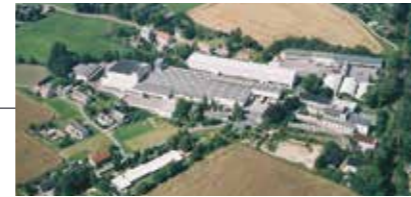
Jokey Plastik Sohland GmbH Germany