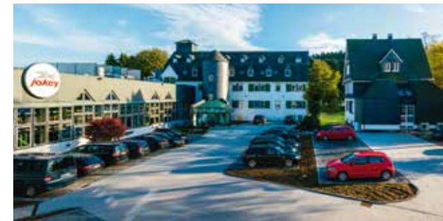
Headquarters of Jokey Plastik Wipperfurth GmbH Germany