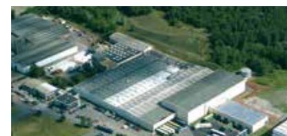
Jokey France S.A. France