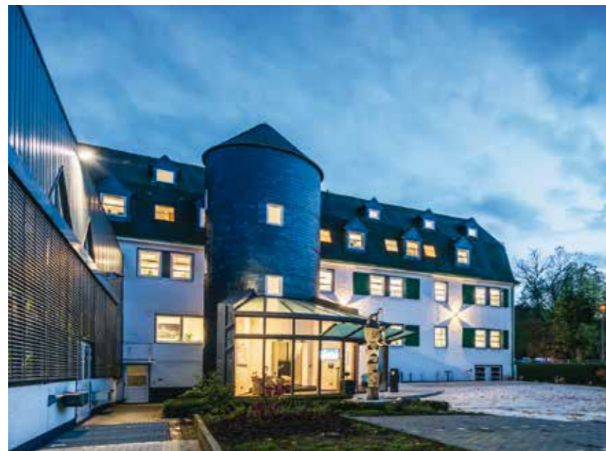
The headquarters of the Jokey Group in Wipperfurth, Germany.