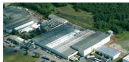
Jokey France S.A. France