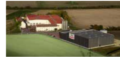
Jokey Plastik Praha CZ s.r.o. Czech Republic