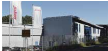
Jokey Werkzeugbau GmbH Germany