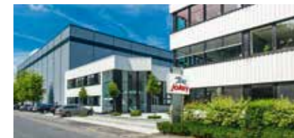
Jokey Plastik Gummersbach GmbH Germany