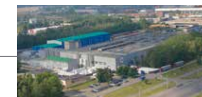
Jokey Plastik Mogilev OOO Belarus