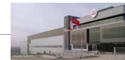
Jokey Plastik Istanbul San.veTic. A.S. Turkey