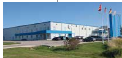
Jokey Plastics North America Inc. Canada