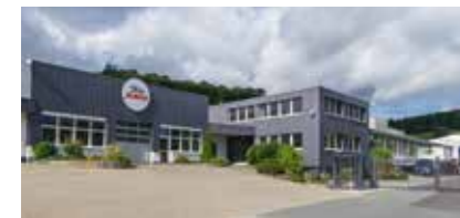
Jokey Plastik Fährnichstütem Germany