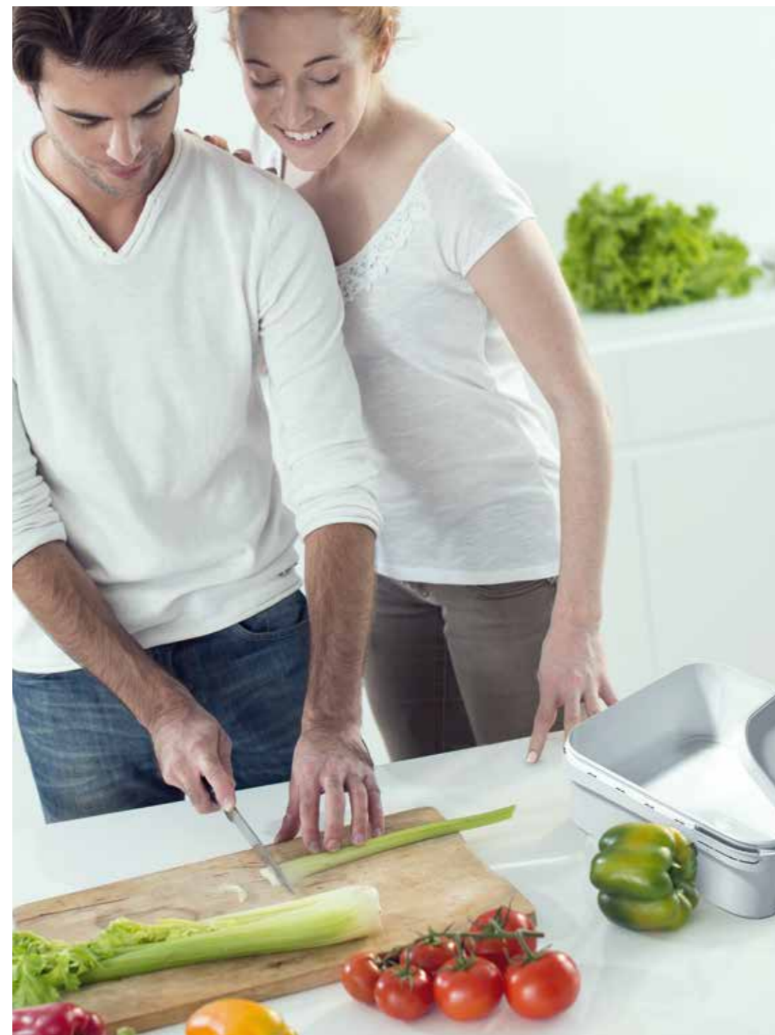
Jokey packagings can be found in every home, on every building site and in every hobby room.