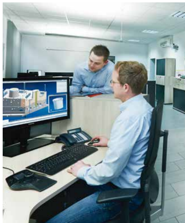
High-tech innovations for maximum functionality and convenience.