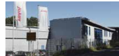
Jokey Werkzeugbau GmbH Germany