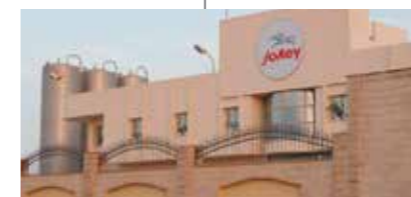
Jokey Egypt for Plastic Packaging Industries Egypt