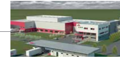
Jokey Plastik Uljanovsk OOO Russia