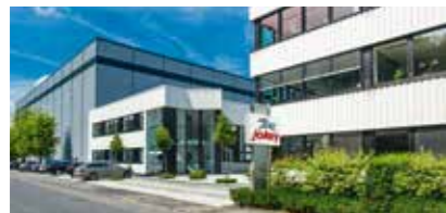
Jokey Plastik Gummersbach GmbH Germany